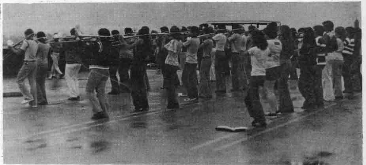
76 TROMBONES: Normandy High School's marching band practices for their role in the Mundy Opera's "Music Man" atop one of UMSL's parking garages.

Most of the students interviewed were annoyed with the increase. But most agreed with one student who said, "With the price of everything else going up it isn't very surprising."