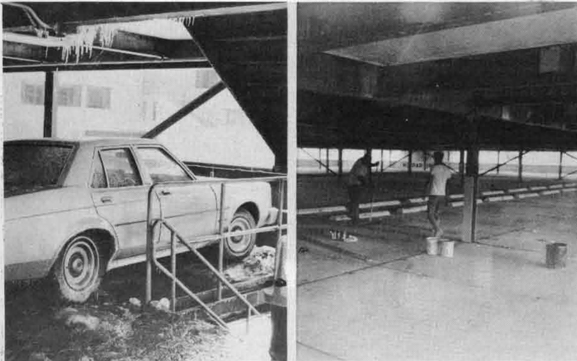
WATERPROOFING: Scenes like this one [left] from last winter may be avoided by work being done now [right] by physical plant workers to weatherproof the parking garages